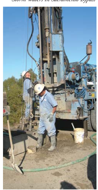
Levee Evaluation Project