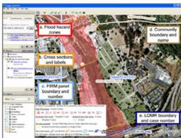
Figure 2. Results after “flying to” an address in Santa Cruz, California. The flood hazard information includes (a) flood hazard zones, (b) cross sections, (c) FIRM panels, (d) communities, and (e) LOMRs.

If flood hazard information is available the map displays: